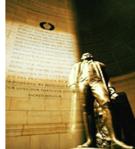
Thomas Jefferson Monument