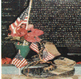
Vietnam Veterans Memorial