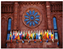
Flags on Smithsonian Castle