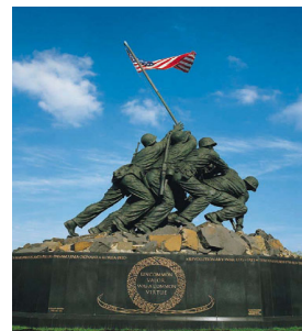
Iwo Jima Memorial

"If one thing goes out of this meeting, it will be sending youngsters to the national capital where they can actually see what the flag stands for and represents."