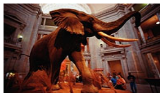
Smithsonian National Museum of Natural History