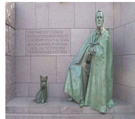
Franklin D. Roosevelt Monument

Exceed your Expectations! Success is Knocking on your Door!