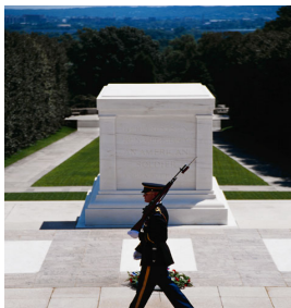
Tomb of the Unknown Soldier