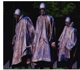
Korean War Veteran Memorial

In addition to all of these wonderful opportunities, you will also make lifelong friends while learning about the importance of rural electrification!